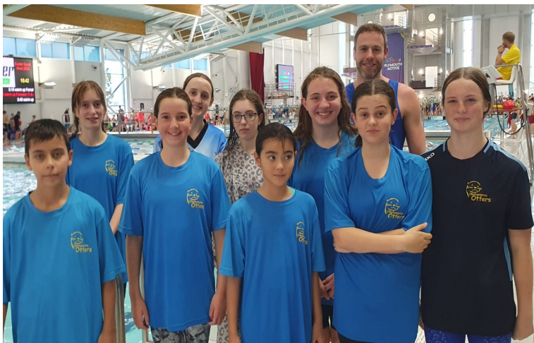
Swimmers at the Exeter sprints 24/9/23